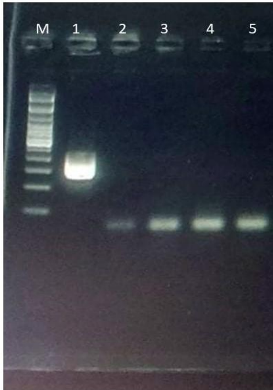
Figure 1. Agarose gel image showing amplified product of aerA gene at 232 bp. Lane M = 100 bp Marker, lane 1 = positive control, lanes 2-4 = isolate 1-3, lane 5 = negative control

Out of 257 isolates, only the positive control isolate showed a band for the aerA gene amplification (Figure 1). The aerA gene fragment produced 232 bp amplicon. The touchdown PCR assay showed no unspecific bands. The result of the assay was used as the basis for the specificity of the LAMP assay by comparing the result of both assays.